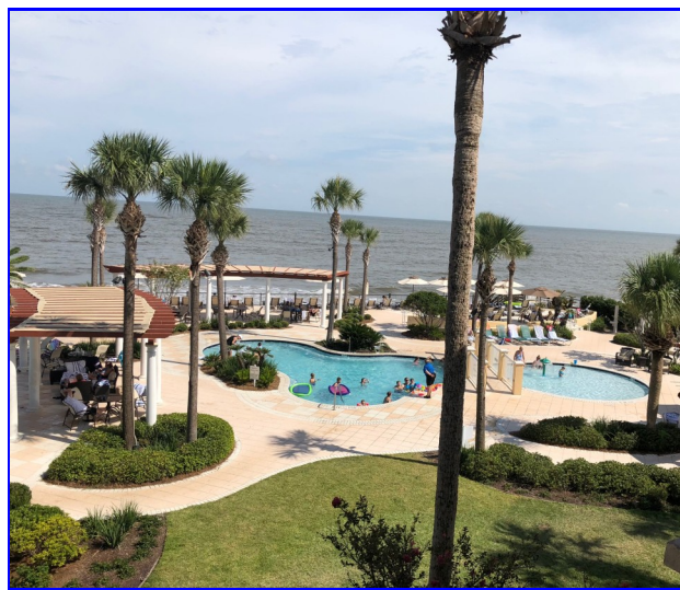
Special thanks to the courteous and professional staff at the King & Prince Beach & Golf Resort. They always make us feel right at home!